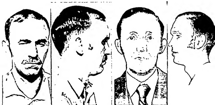
Photographs taken 1973