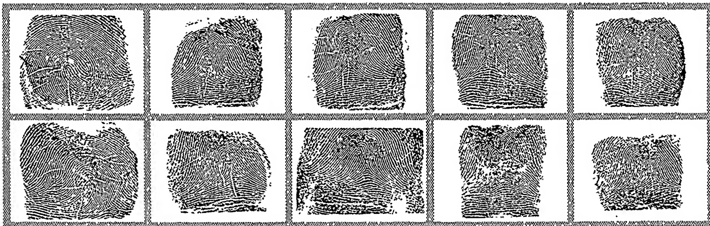
Photographs taken 1972